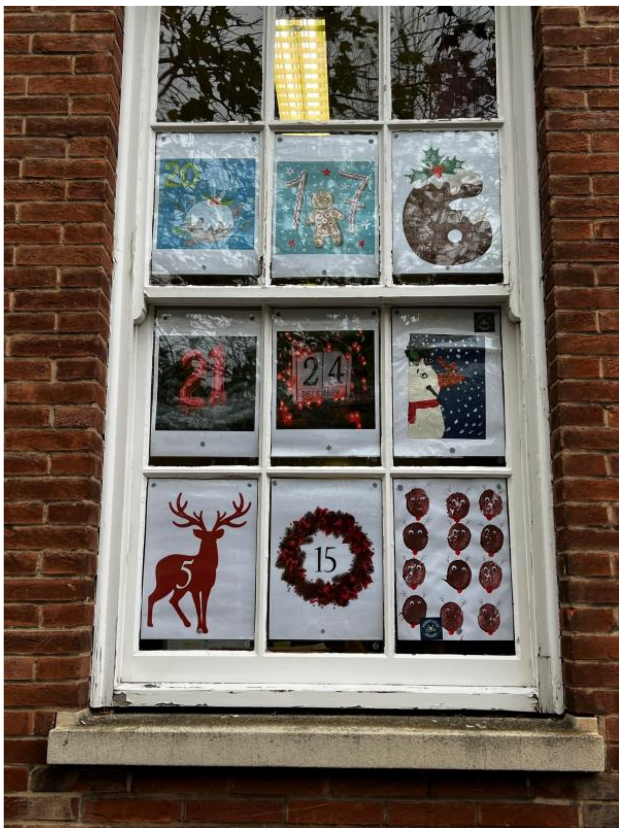
1 - Rugeley Library Advent Calendar