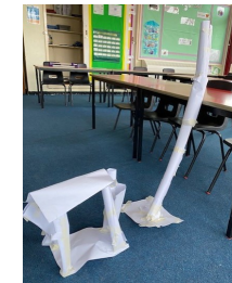
Wellbeing Garden Competition.