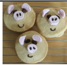
Baking Piggy biscuits

Try and use different words when you are talking about the movements of the objects e.g. floating, sinking, moving, fast etc