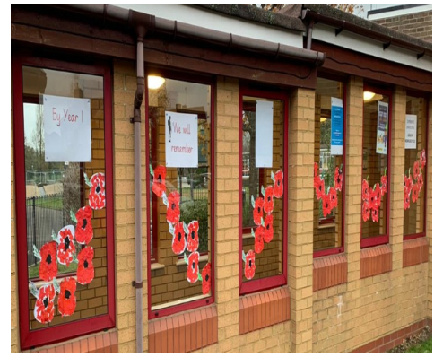
Year 1 Year 2