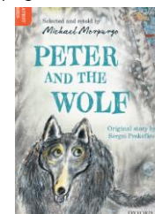
Peter and the Wolf By Michael Morpurgo

Your challenge is to read the same books and vote for your favourite. Remember to think of 3 reasons why! Send your answers to the Year 6 email address above by the First Day back after the holiday!