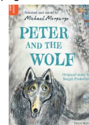
Peter and the Wolf By Michael Morpurgo

Your challenge is to read the same books and vote for your favourite. Remember to think of 3 reasons why! Send your answers to the Year 6 email address above by the First Day back after the holiday!