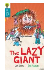
The Lazy Giant

Your challenge is to read the same books and vote for your favourite. Remember to think of 3 reasons why! Send your answers to the Year 3 email address above by the First Day back after the holiday!