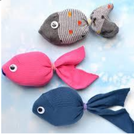
"1,2,3,4,5 Once I Caught a Fish Alive"