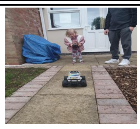
The remote control traffic has increased in lockdown!