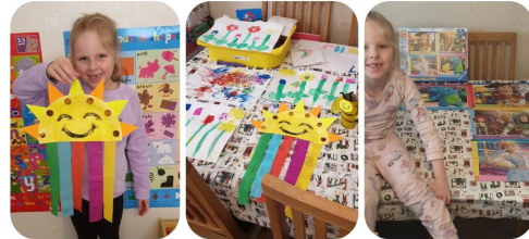
Here are Sophie's wonderful rainbows!